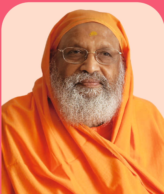
Pujya Swami Dayananda Saraswati

Danam , giving and sharing, is a mark of growth. Not giving is a mark of being stunted. Remaining a consumer all the time, and not becoming a contributor, is not the Vedic view of life. We have to be contributors. A person who consumes the least and contributes most is a mature person, for in giving lies the self-growth.