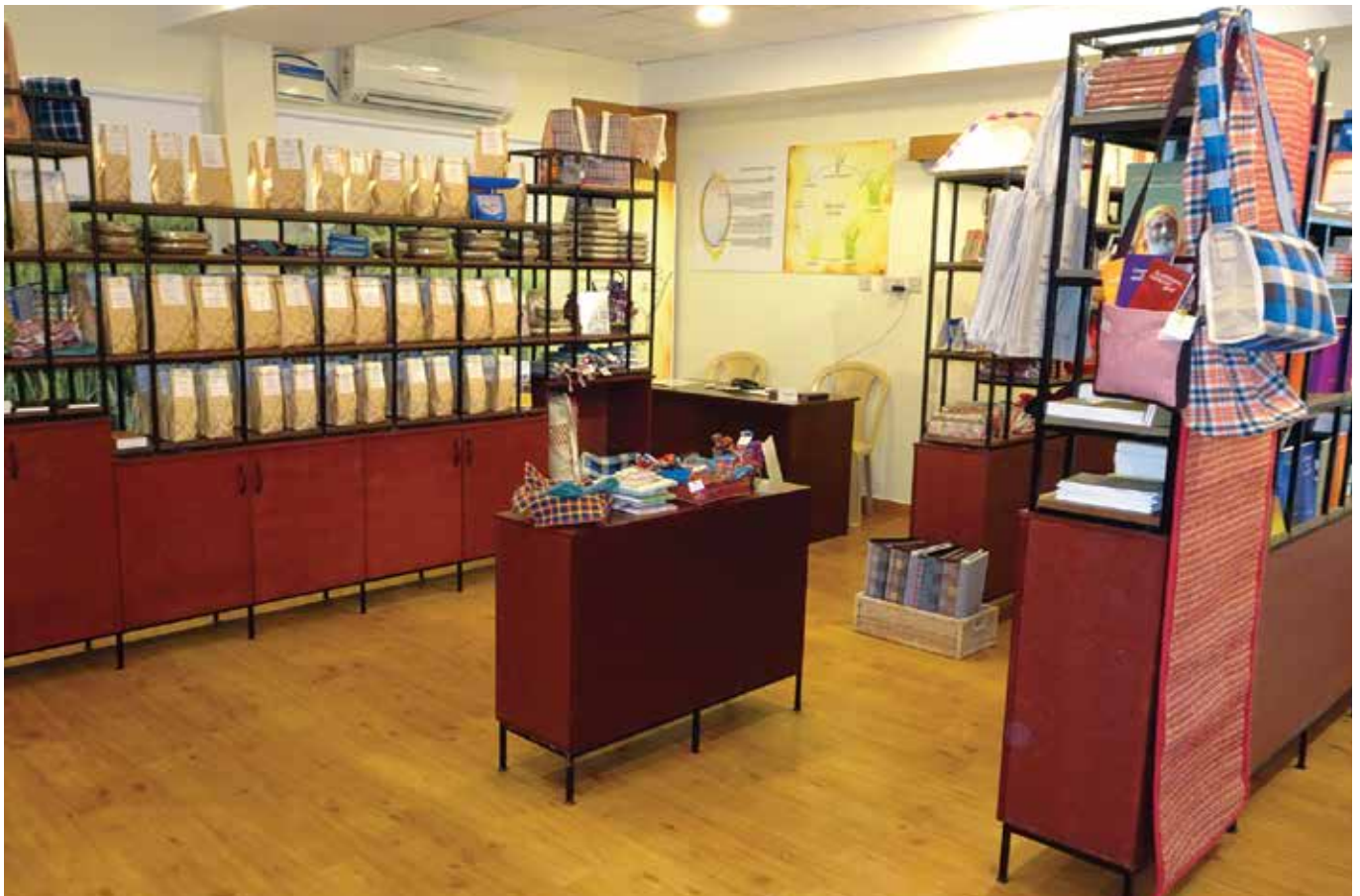
A view of Spirit of the Earth's immersion centre in Chennai, Tamil Nadu.