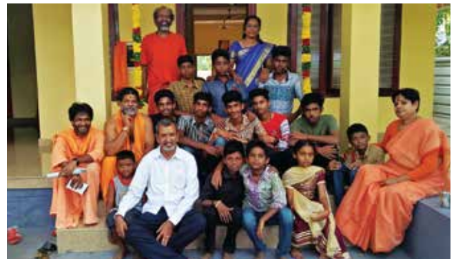
Our boys sitting outside the new building