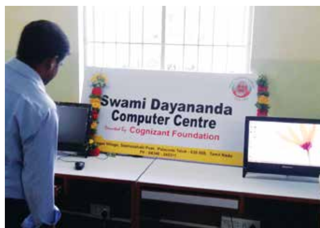
The computer centre at Swami Dayananda Vidhyasramam in Karagur Village, Dharmapuri, Tamil Nadu ready to be used.

“Great to see how the efforts of AIM for Seva has borne fruit in a very backward area with limited educational facilities and consequently high unemployment among the youth.”