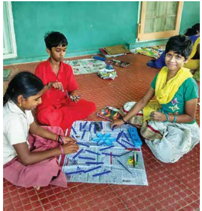
Students working on an upcycling craft activity