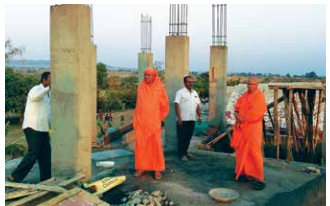
Our coordinators inspect the progress of construction.

There are 50 boys living in Smt. Susheela & Shri. Madhukar Rao AIM for Seva Free Student Hostel and the Sadanand AIM for Seva Free Student Hostel in Pangri village in Rajgurunagar, Maharashtra. Inaugurated in 2010, this hostel has received an overwhelming response from the local community. With the support of Bajaj Auto Ltd. and Atlas Equifin Pvt. Ltd., construction of a new building has begun. The new facility will house all 50 boys and have the capacity to accommodate more in the next academic year.